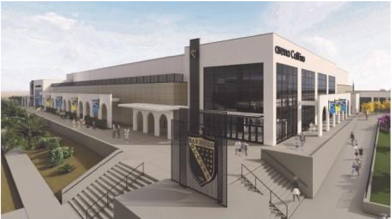
The San Diego Sockers are looking to build a 171,000-square-foot arena with a 36,000-square-foot public outdoor plaza.